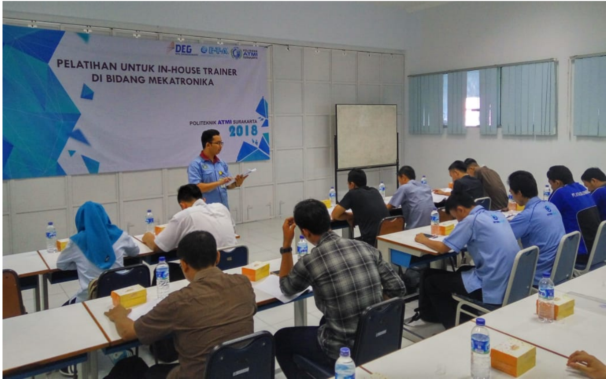
The atmosphere of training in theory classes, guided by instructors and lecturers are experienced in their field