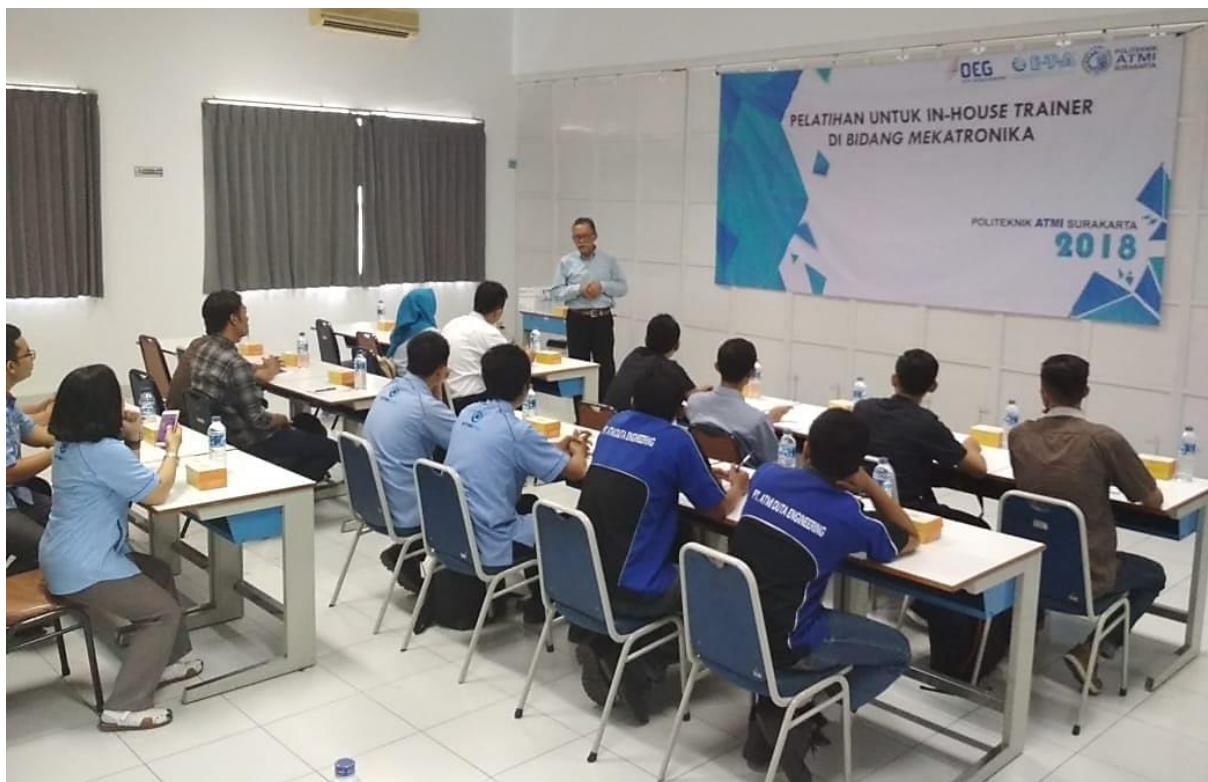
Opening of training by Director of APII

This training was attended by 13 participants from PT. Rayon Utama Makmur, CV. Mitra Sentosa Mandiri, PT. ATMI Solo, PT. Indonesia German Institute (IGI), PT. ETA Indonesia, CV. Solid Sinar Semesta, PT. Deltomed Laboratories, PT. ATMI Duta Engineering (ADE)