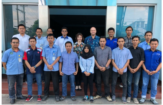
Discussion and evaluation of training process