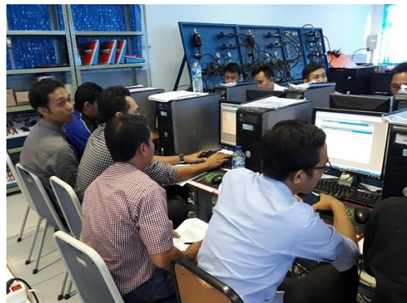
The atmosphere in laboratory practice activities using Mechatronics equipment guided experienced instructors